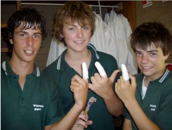
In Jurassic Park, students make moulds of their fingers in readiness for the creation of a finger fossil.